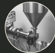
FLO OUR LATEST ADDITION

We take great pleasure in hearing all of the lovely reviews about our products and find this to be extremely motivational. We work very hard to ensure each jar is made perfectly.